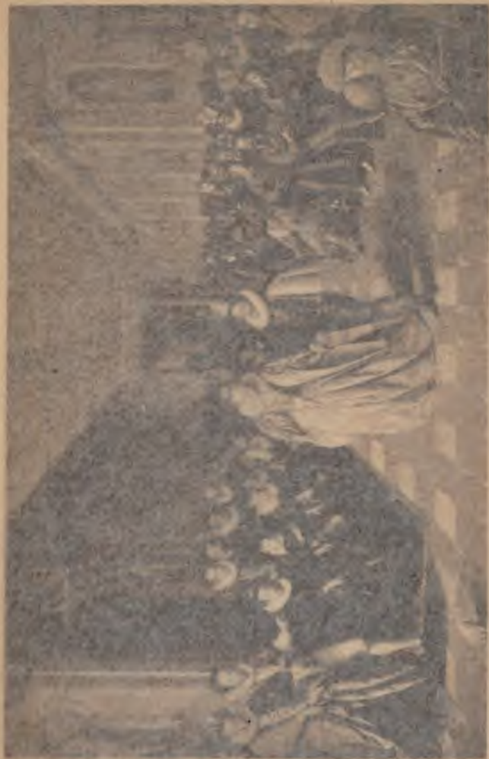
Bull at the Court of Henri III